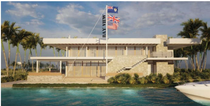
The Sports and Leisure Facilities Plan